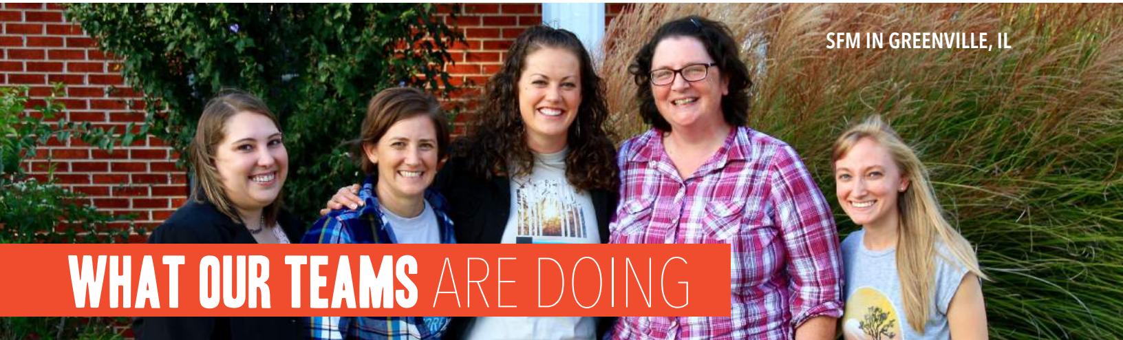
SFM IN GREENVILLE, IL