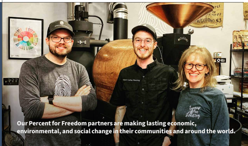
Our Percent for Freedom partners are making lasting economic, environmental, and social change in their communities and around the world.